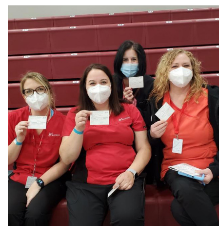
BAYADA Nurses proudly display their vaccination cards.